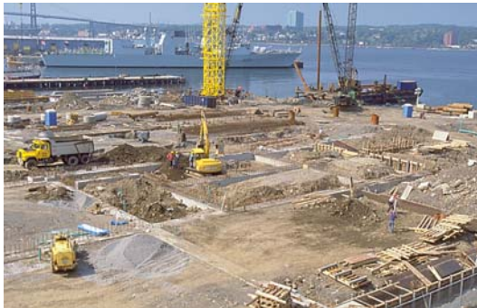
CASINO NOVA SCOTIA CONSTRUCTION SITE HALIFAX, NOVA SCOTIA