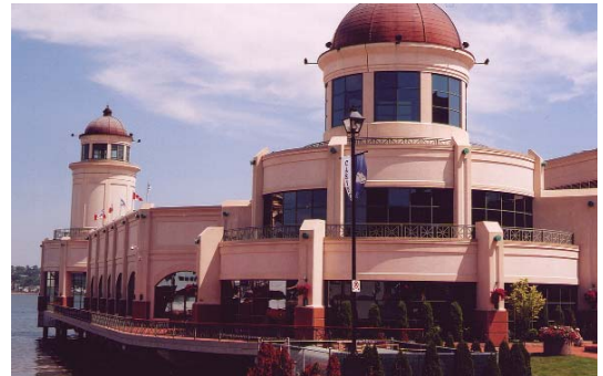
CASINO NOVA SCOTIA HALIFAX, NOVA SCOTIA