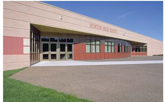
HORTON HIGH SCHOOL WOLFVILLE, NOVA SCOTIA