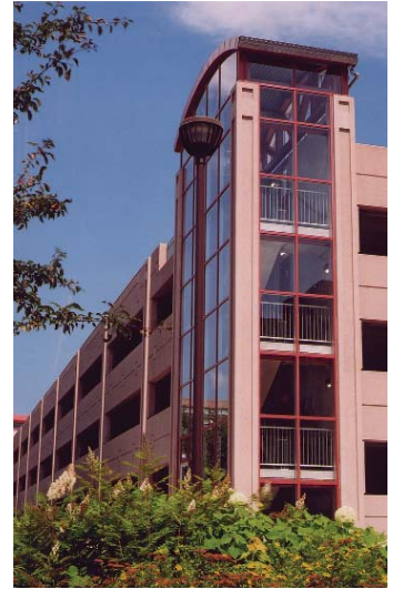
QEII HEALTH SCIENCES CENTRE PARKADE HALIFAX, NOVA SCOTIA