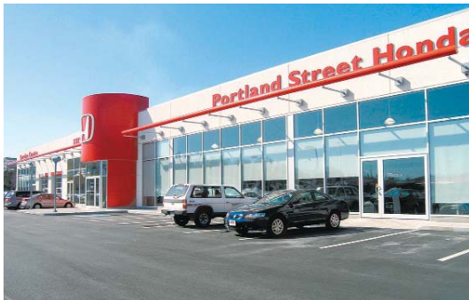
PORTLAND STREET HONDA DARTMOUTH, NOVA SCOTIA