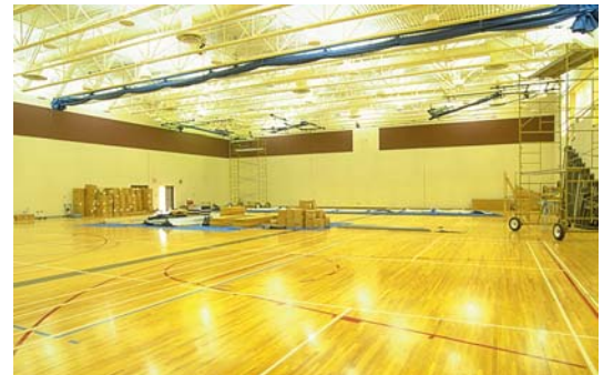
HORTON HIGH SCHOOL WOLFVILLE, NOVA SCOTIA