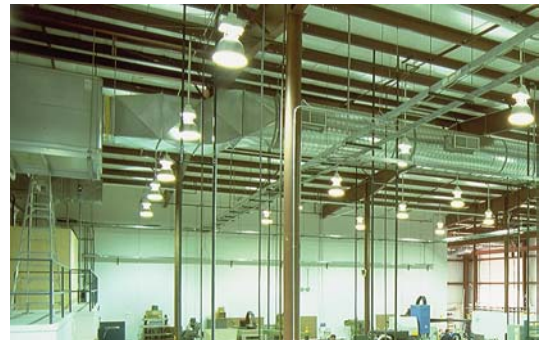
GN PLASTICS CHESTER, NOVA SCOTIA