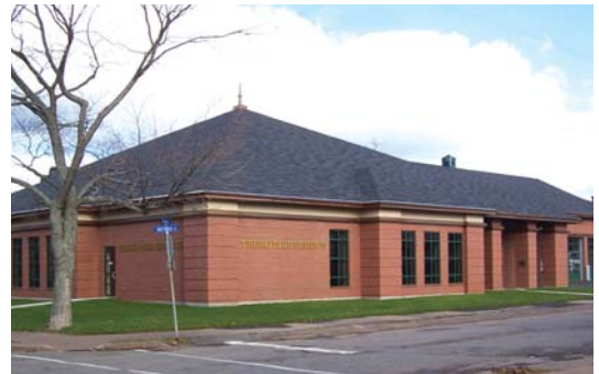
TRURO FIRE HALL TRURO, NOVA SCOTIA