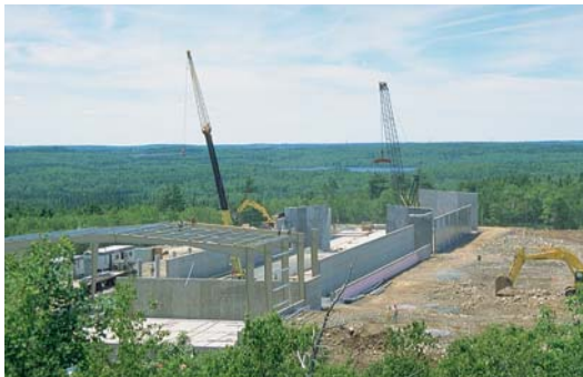
MILLER COMPOSTING FACILITY BURNSIDE INDUSTRIAL PARK; DARTMOUTH, NOVA SCOTIA