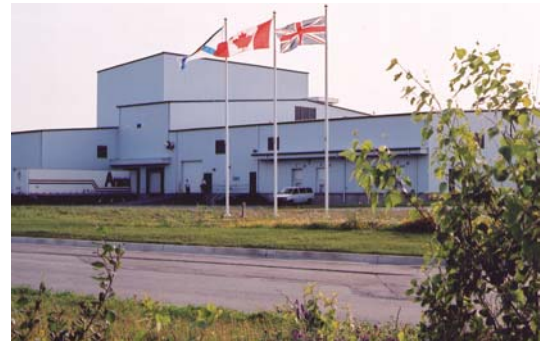
THE HALIFAX HERALD LIMITED ATLANTIC ACRES INDUSTRIAL PARK; BEDFORD, NOVA SCOTIA