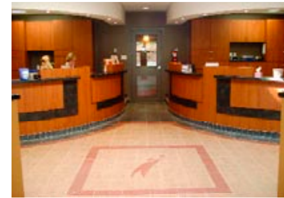
ABOVE: Nova Dental occupies the 2nd level of their new building on Sackville Drive, with the first level reserved for 3 tenants